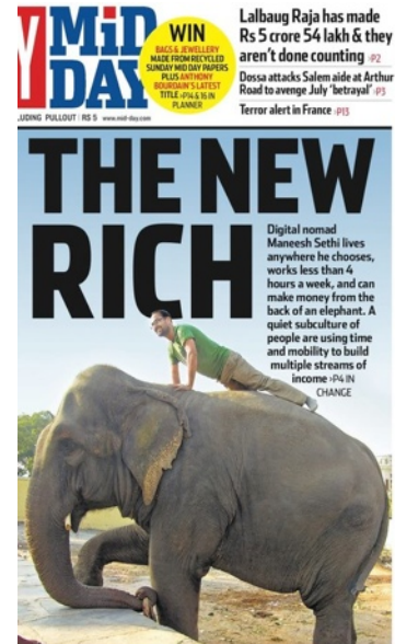
How I Started A Digital Nomad Biz