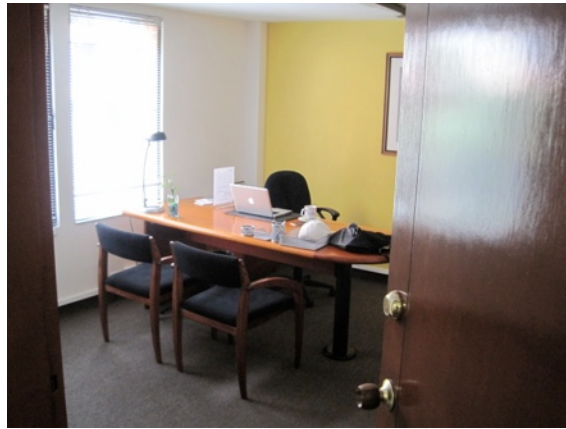
My Office in Bogota, Colombia (incl. private bathroom)

Regus is a company that specializes in office space, all over the world. Whenever I travel to a new country, I use them to find a place to set up shop, get free wifi and free coffee.